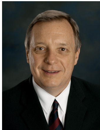
Richard J. Durbin

"Making recommendations to the White House on judicial nominees is one of the most important jobs I have as a U.S. senator and I am particularly pleased that these outstanding Illinoisans have agreed to advise